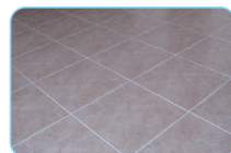
Small Square Brick Flooring